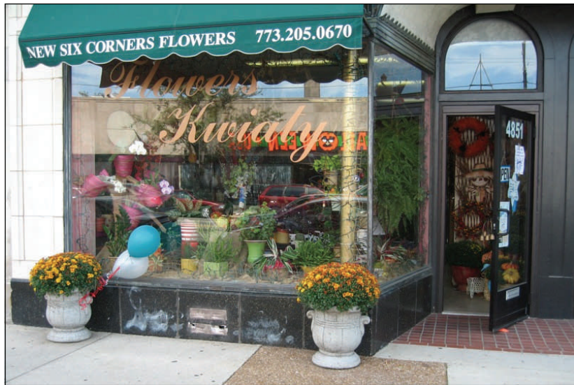
News Six Corners Flowers, 4951 W. Irving Park Road, always has an attractive floral display inside and outside the shop, leaving no doubt what this business sells.

3. Follow the Rule of Three by grouping or displaying items in threes. Display three items of the