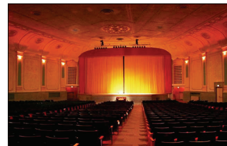
The Portage Theater will be featured in a new neighborhood tour

Dan Pogorzelski, who co-authored a history book on Portage Park, will be