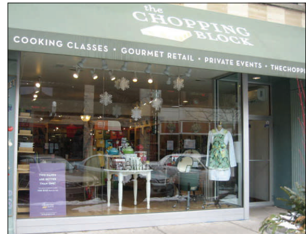
This storefront from the Chopping Block in Lincoln Square has a clean look, puts merchandise on display and still gives a full view of what's inside.

7. Consider tagging prices on a few specials (three perhaps) in the window. Featuring a few deals will draw customers in and give them a general idea of your price ranges.