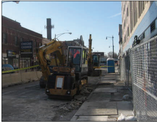
Part of the streetscape work includes filling in a vault under the sidewalk on the Cicero and Milwaukee sides of Klee Plaza.

The next phase of work will move to the south side of Irving west of Cicero and the